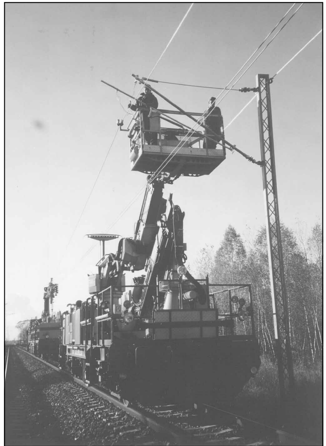
Catenary Crane Car FKW 1

The crew of the train is very positive about working with the new equipment - the possibility to install catenary wires with constant mechanical tension and the use of efficient, modern work platforms and cranes are regarded as very welcome, as they significantly reduce the degree of physical effort involved, whilst offering a safe working environment.