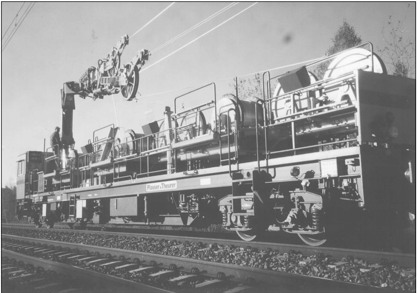
Catenary Assembly Machine FUM 100-V

The overhead wires are drawn up over the adjustable cable deflection units by the loading crane. Three tiltable frictional cable winch units are mounted on the machine, each consisting of a storage drum holder, a hydraulically driven winch wheel on a second, synchronised winch wheel. One cable winch unit serves to install the new carrying cable, whereas the other two units are used to install the two new contact wires. The units are in both tiltable and laterally displaceable design, which enables the wires to enter the deflection wheels of the crane, or the frictional cable winch wheels, in a straight line;