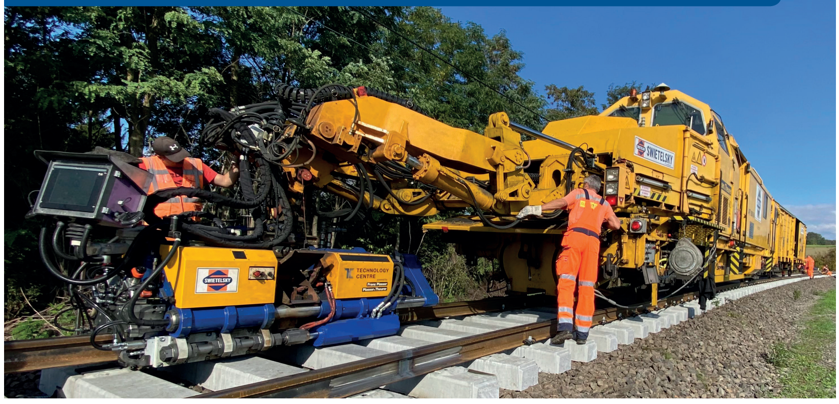
The Plasser FlashWelder was trialled in regular service by Swietelsky, mounted on a rail-bound carrier vehicle.

as optimising the overall dimensions and reducing its mass. The total weight of the new head is approximately 3 500 kg, representing a reduction of around 20% compared to the previous generation. As well as reducing the axleload of the carrier vehicle, this weight saving has had a positive effect on the manipulator design and provides an improved operating range.