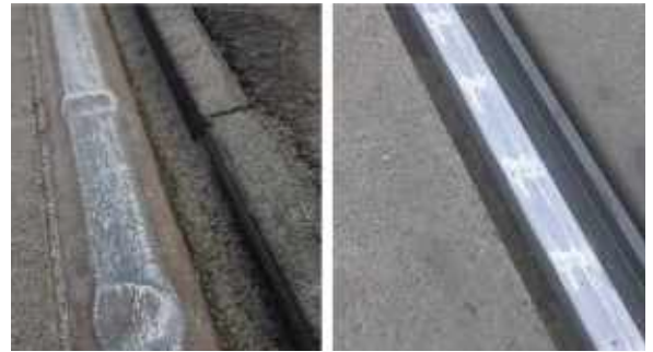
Common rail defects for grooved rail include wheel burn (left) and corrugation (right).

Passive grinding with sliding stones is the most basic technique. The stones are applied to the rail head under pressure and towed by a separate vehicle. This