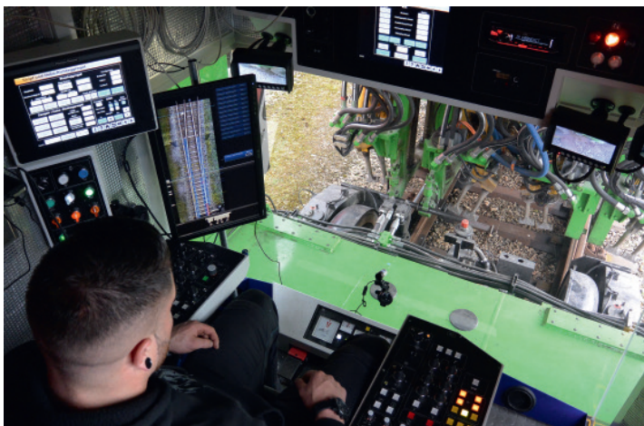
FIG. 5: Tamping cabin with the assistance system "PlasserSmartTamping - The Assistant"