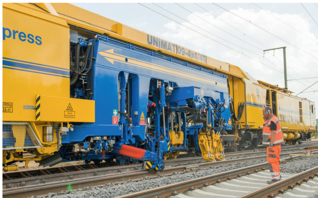
FIG. 1: Operators of turnout tamping machines must meet high requirements

The first step is to develop the digital track twin. When selecting the hardware components of the turnout tamping assistance system (one rotation laser, four light section sensors and one colour camera), it was ensured that the hardware can be exchanged and that the software can be adapted modularly.